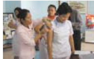
Flu vaccination for healthcare workers.