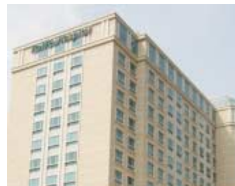
A hospital for all your healthcare needs.