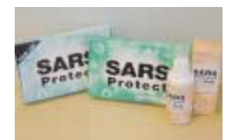
Raffles Health launches SARS Protect range of products.