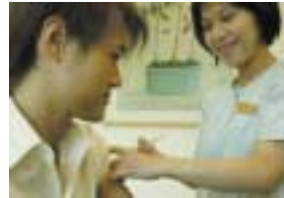
Flu vaccination for staff.