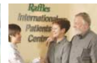
Newly opened International Patients Lounge.