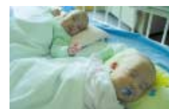
Ji Hye and Sa Rang successfully separated.

In January 2004, we opened up our new International Patients Lounge on the second storey of Raffles Hospital where foreign patients can have one-on-one discussions with our officers, plan their stay in Singapore and surf the medical internet.