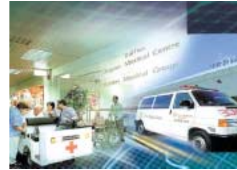
Emergency medical evacuation at Changi Airport clinics.

... to be at the forefront of battle against diseases and epidemics.